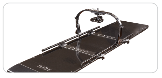
Rails-Only with Bridge and Respiratory Plate