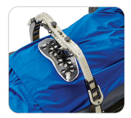
Wide Respiratory Plate with ComfortCare Cushion (Shown with ONEBridge<sup>™</sup>)