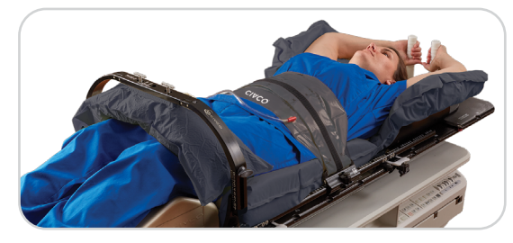
Rails-Only patient setup

MTSBRT060 53 cm – Varian Exact ⊙ MR Series<sup>™</sup>