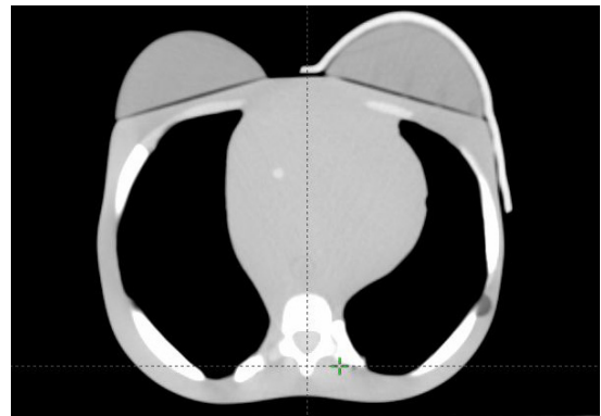
Flexible, patient-specific bolus provides superior fit and adheres to the surface shape of complex anatomies, such as a breast.

“Adaptiiv has enabled us to confidently tackle situations where we would normally struggle to apply bolus. The benefit has already been seen in reduced setup times, improved patient comfort, and reproducibility. The ability to print the precise bolus required for electrons or photons is a powerful tool in an RT department.”