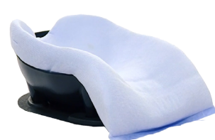
Type-S™ with AccuForm Cushion