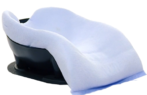
Posifix® with AccuForm Cushion