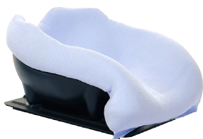
Posifix® with AccuForm Cushion